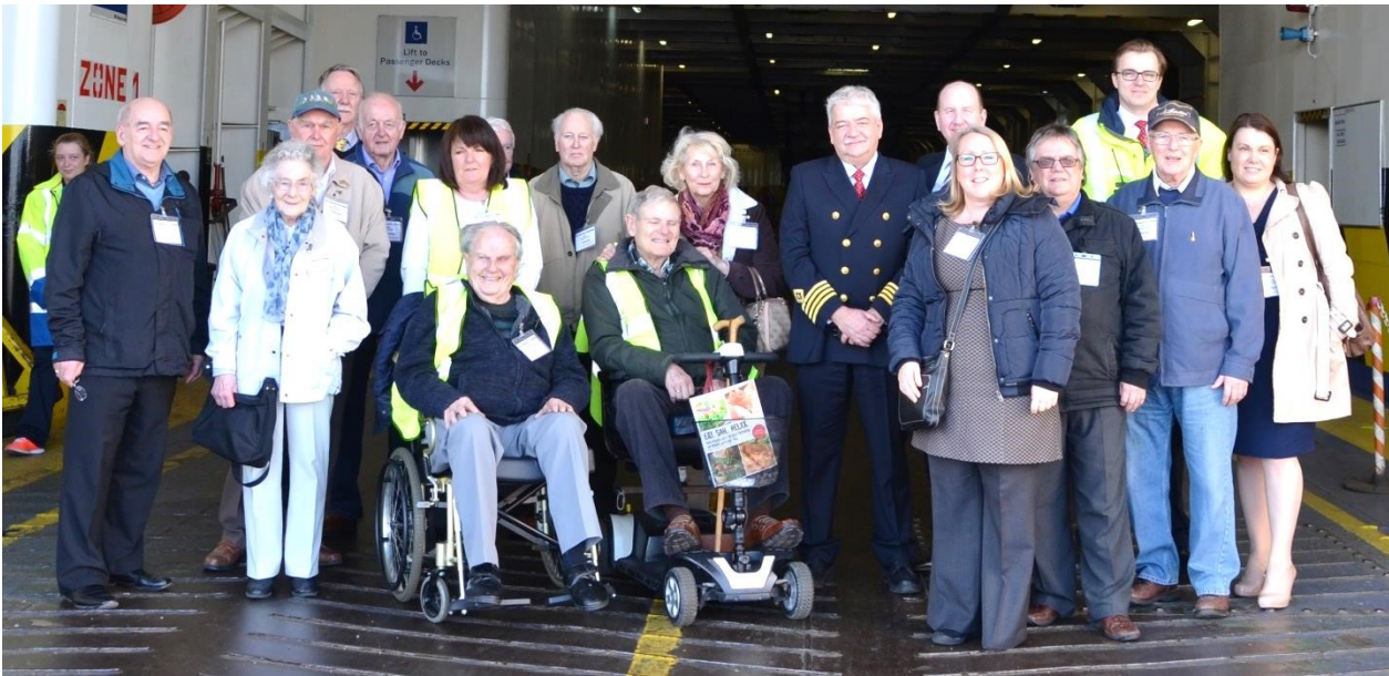
Waiting to go aboard