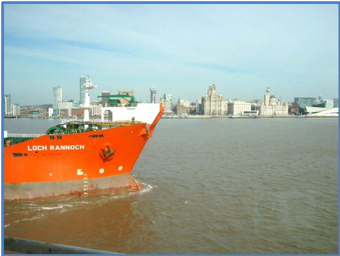
Loch Rannoch from the bridge