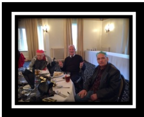
Christmas at Leasowe Castle