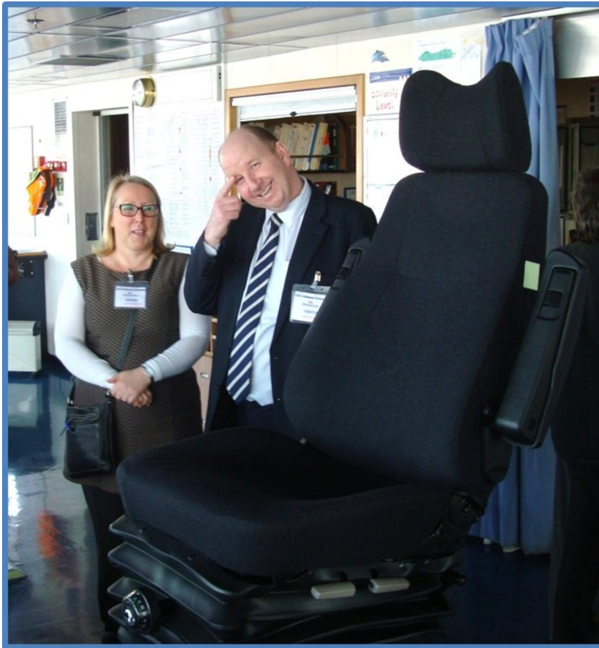
“Who’s taking her to New Brighton?”