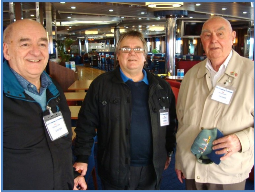
Three wise men?