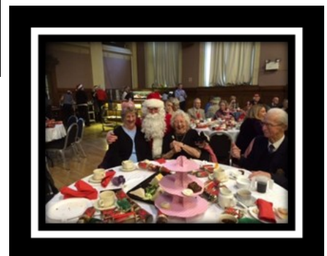
Christmas Party Wallasey Town Hall