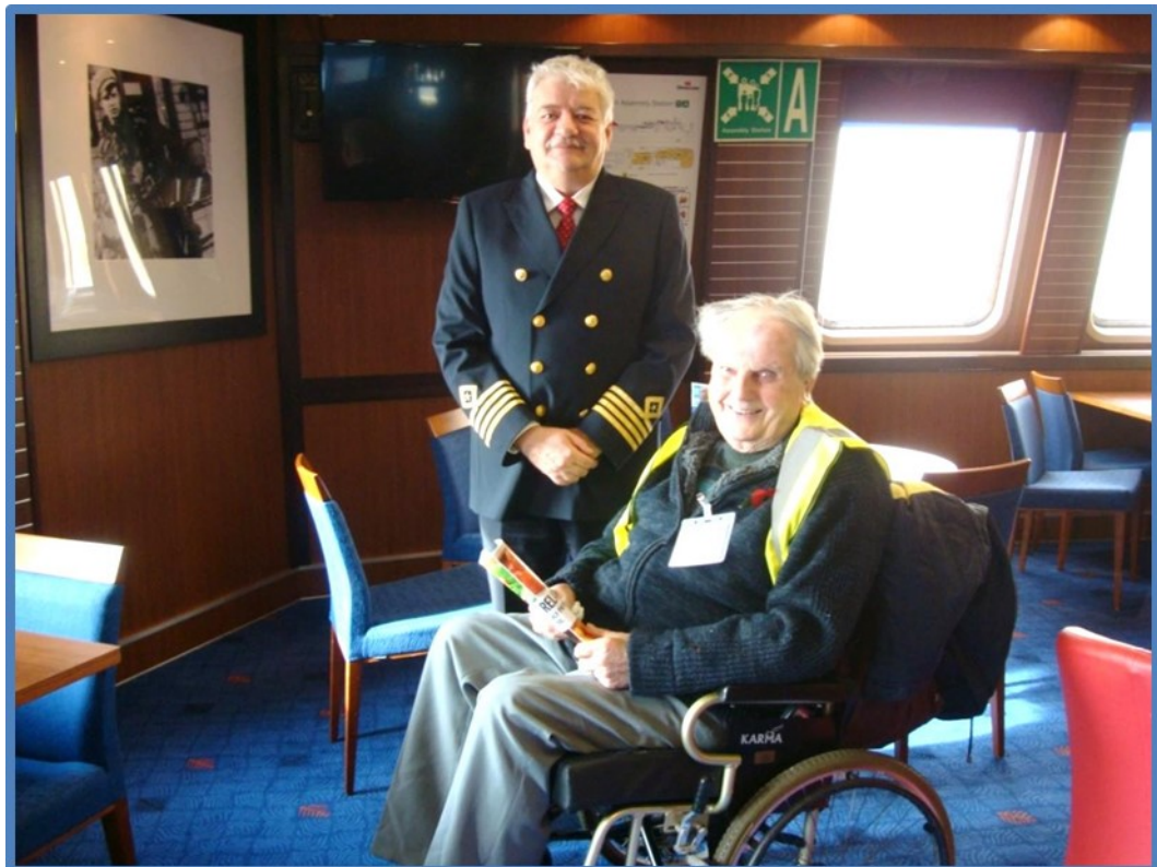
Two Ferry Captains together