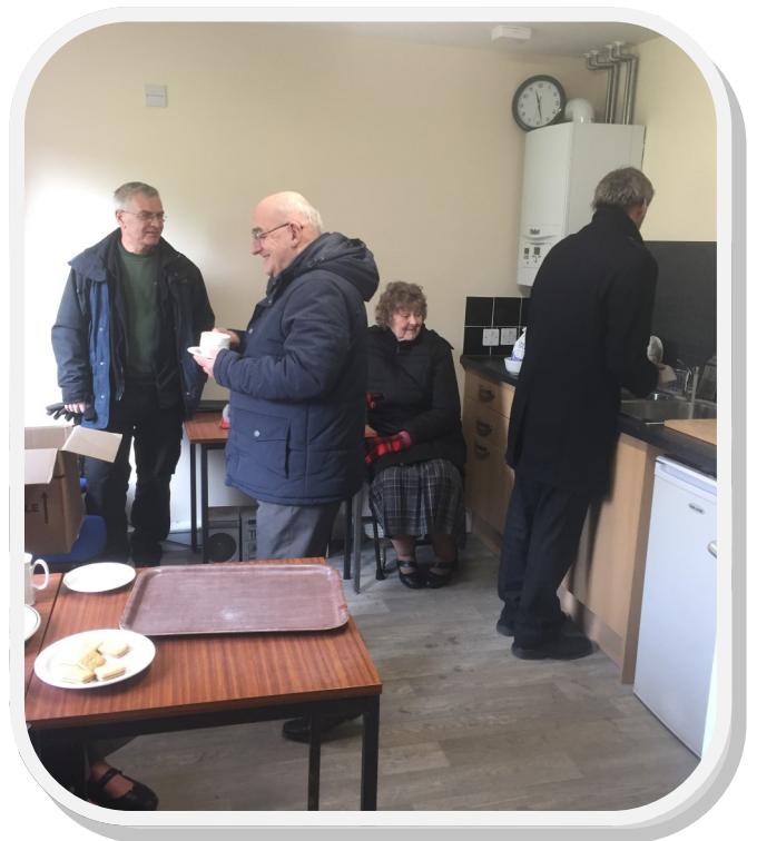
Good to see the boss washing up!