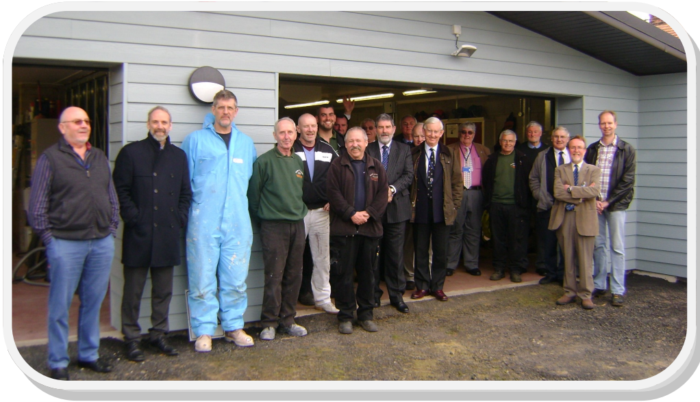
The Nautilus Welfare Fund Committee met the Estate Team to view the new workshop