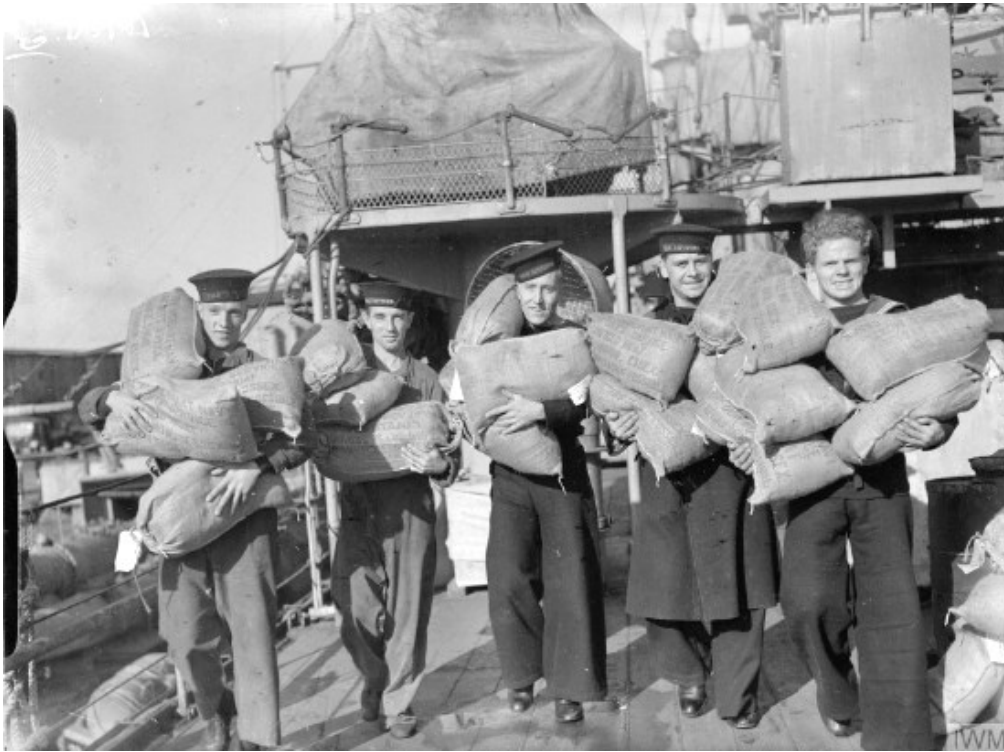
Warm Dry Clothing carried by R.N for Merchant Navy Survivors