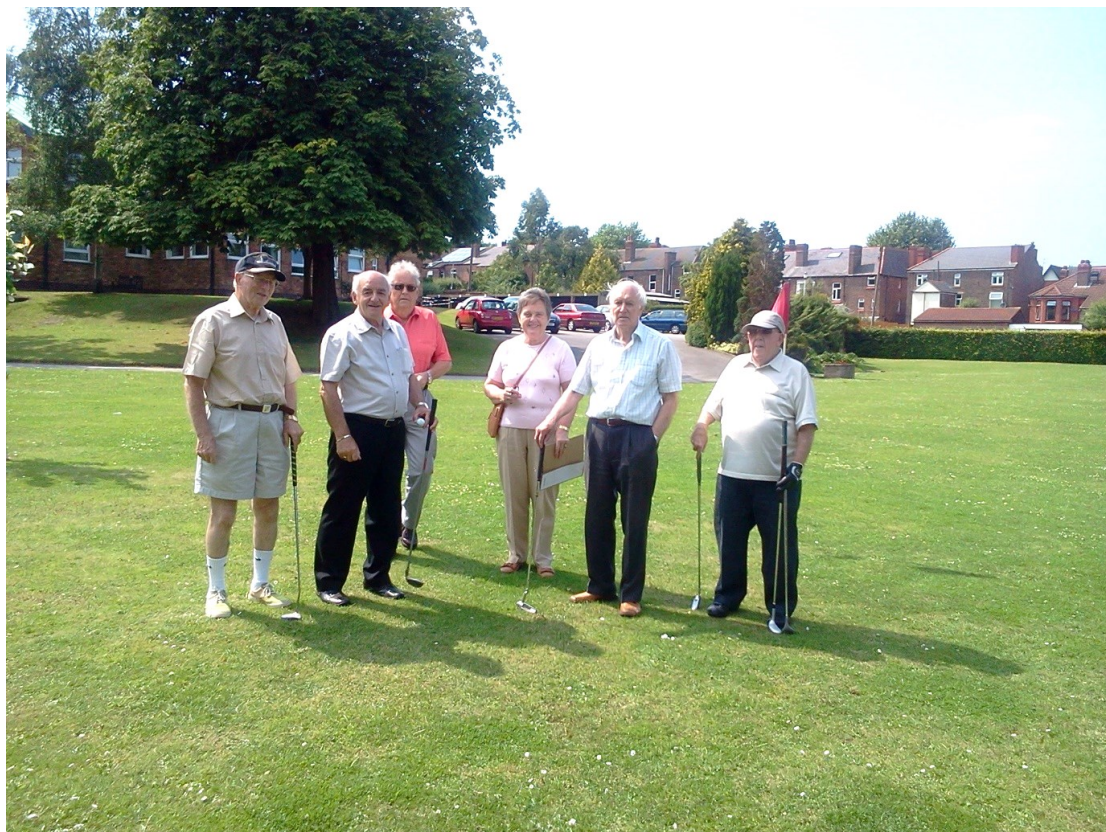
Before Social distancing !