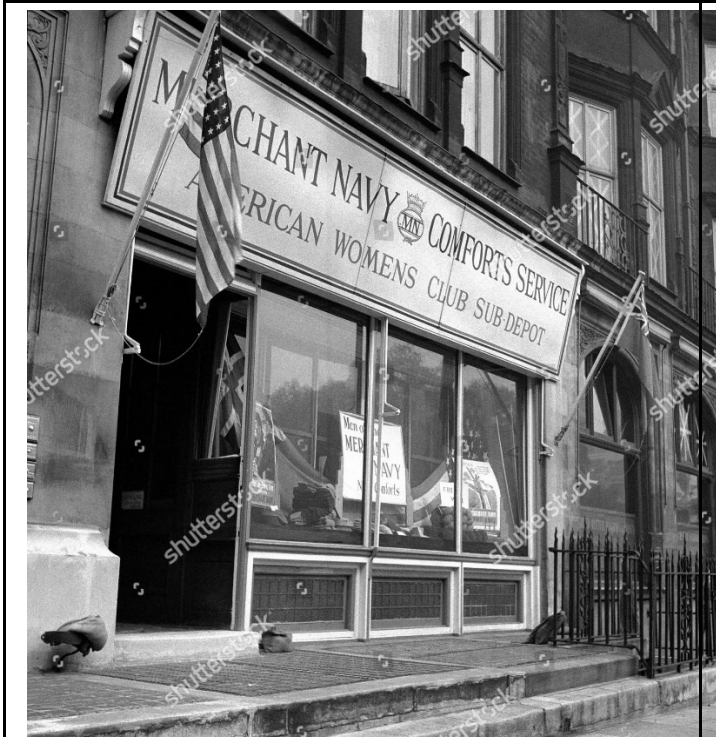
Merchant Navy Comforts Service, London,